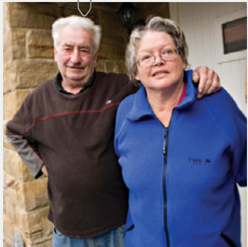
A small affordable housing development in Chop Gate provided houses for elderly couples and young families.

All these local people are delighted that Stewart Court has allowed them to continue living in and contributing to their village.