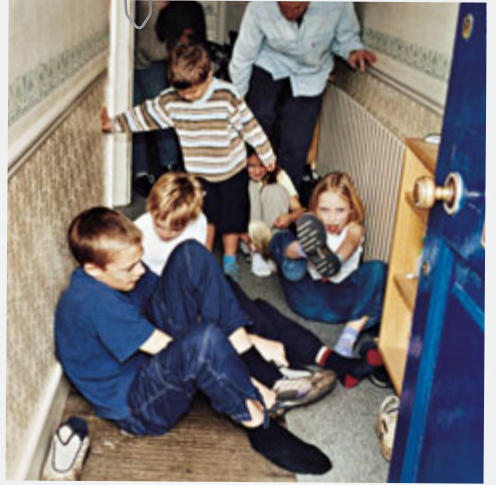
Overcrowding can be a major problem for families with children.