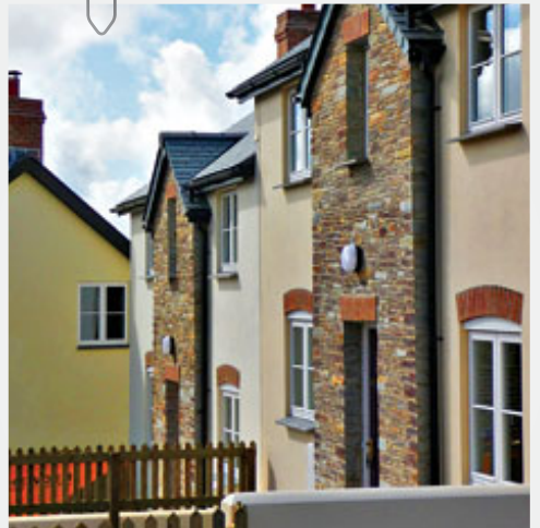
New homes built with local materials at Percy's Meadow in Blisland, Cornwall.