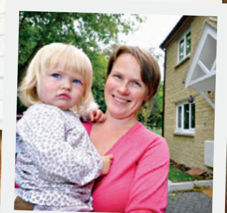
Residents of Cottsway Housing's development of five homes at Akeman Rise, Ramsden, Oxfordshire.