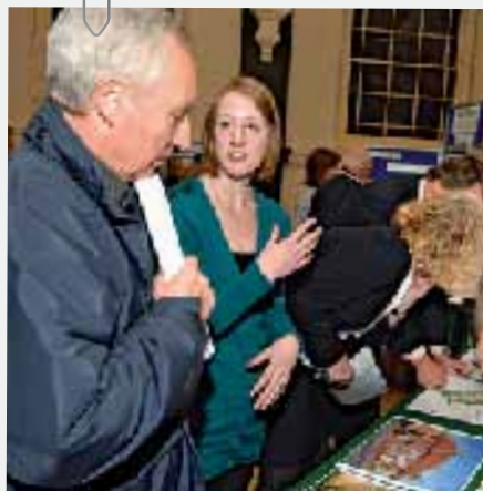
Hungerford people shaped the new development.

As a result of the support engendered by the extensive community consultation, the Town Council have its full support to a planning application for 16 homes on the site. This was approved by the local council in March 2010, and work started on site in May that year.